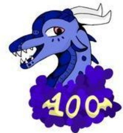
3rd place winner