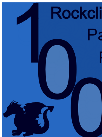
1st place winner