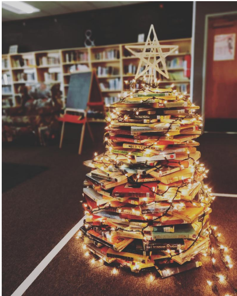
Kids turn pages into holiday cheer in the Connie Behr Memorial Library.

FERRVM ACVIT FERRVM Iron Sharpens Iron LCHS Class of 2019 Motto